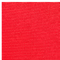
Logo Red 1066