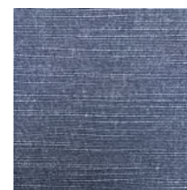
Tandem Marino 8448