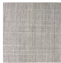
Tandem Sand 8441