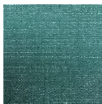
Tandem Botella 8450