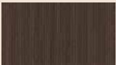
Cocoa Bean A32