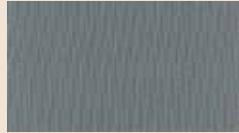
Silver Grey A91