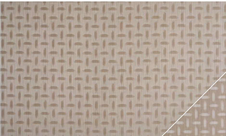
Brush Hemp J170

Because our Jacquard designs are based on a double interplay of colours, your fabric takes on a different aspect depending on whether you are above or below it.