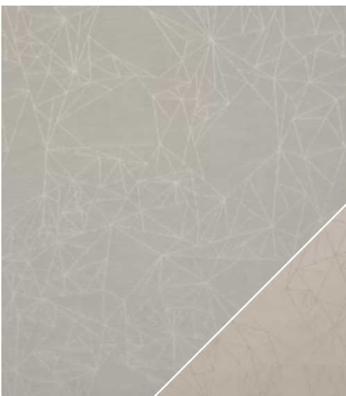
Constellation Grey J178