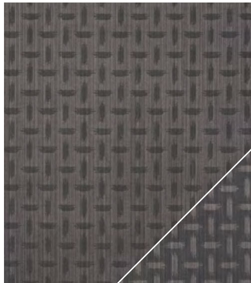
Brush Carbon J172