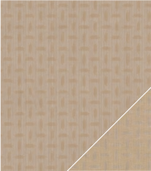
Brush Beige J169