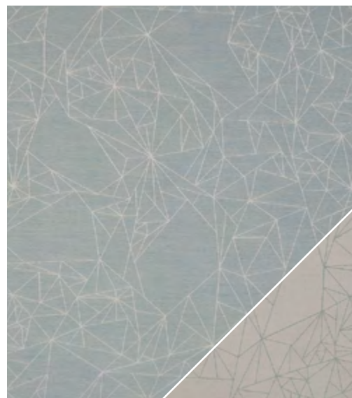
Constellation Blue J180